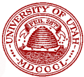
Senior Vice President for Health Sciences Organizational Chart July, 2011